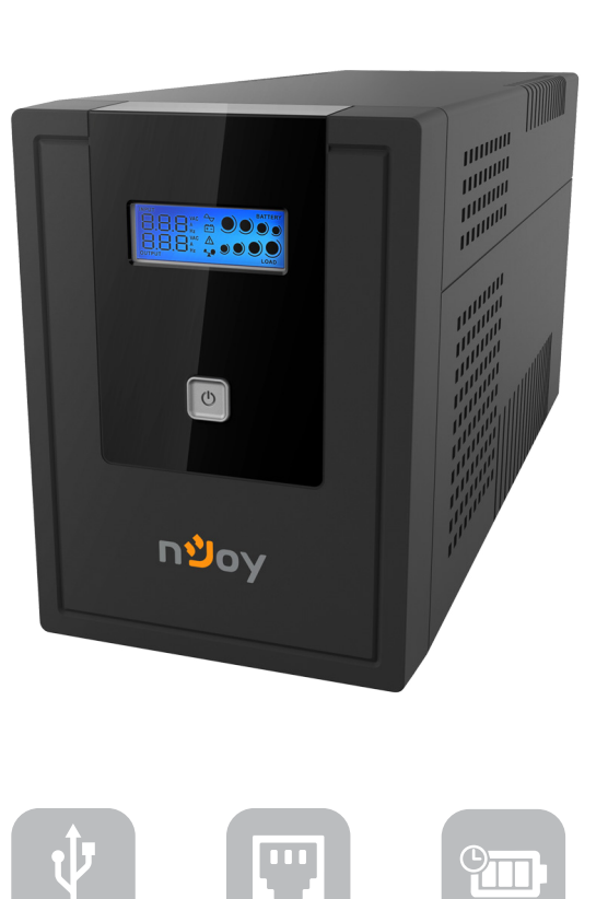
HID USB port